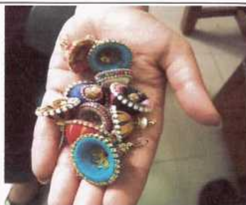
Workshop on Making Jewellery