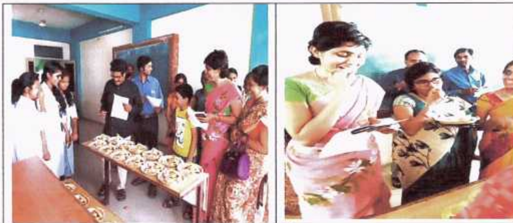
Food Fest by Women